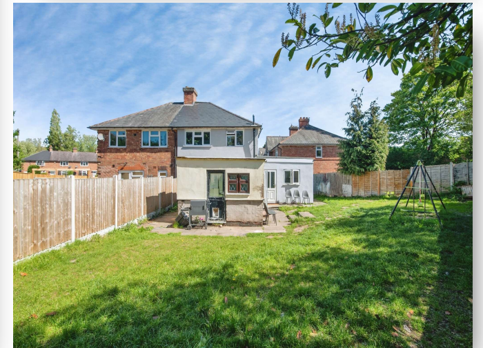
Halsbury Grove, Birmingham B44 0DU