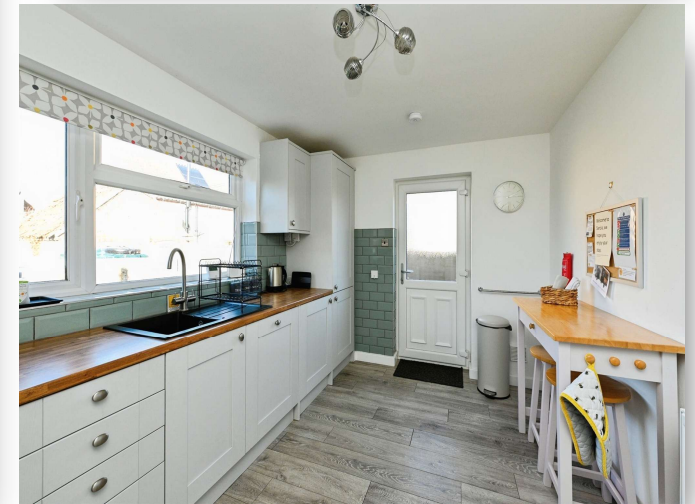
Peddars Way, Holme Next The Sea, PE36 6LE