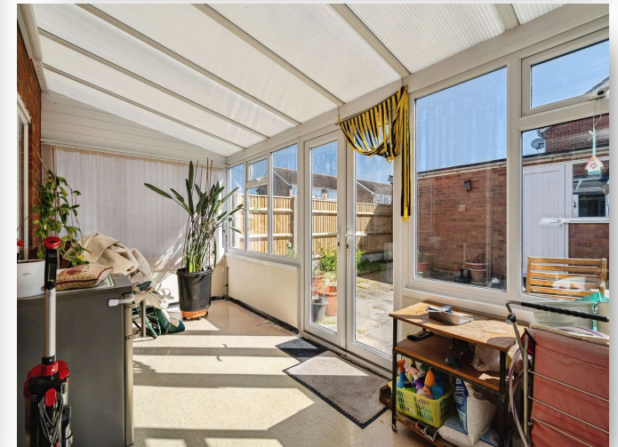
Sands Lane, Lowestoft NR32 3HA