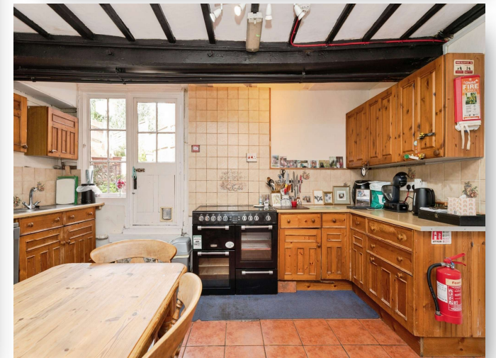
St Davids House Friday Market Place, Walsingham, NR22 6DB