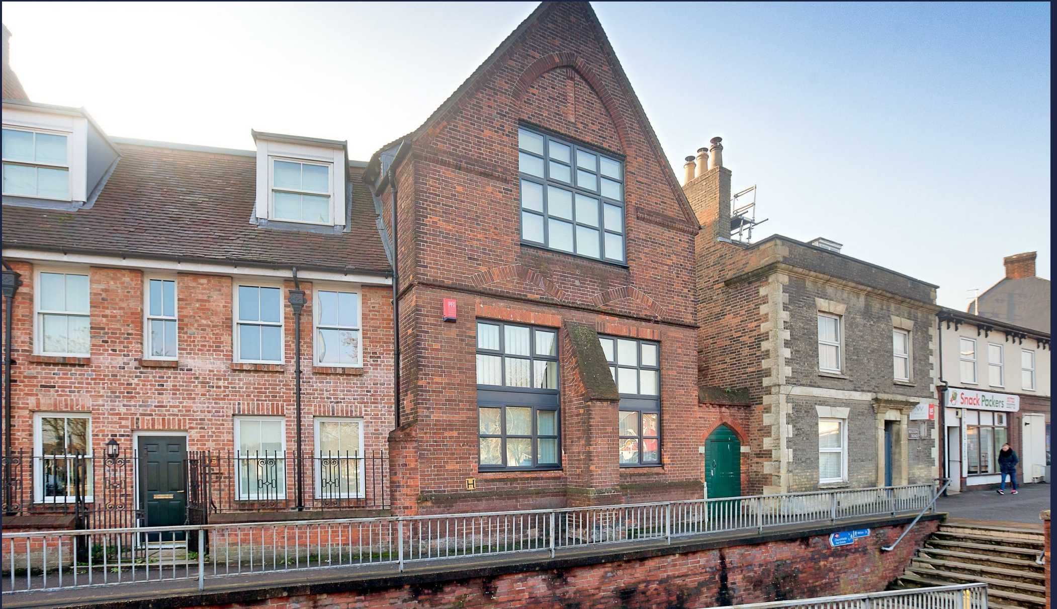
161 Fisherton Street, Salisbury