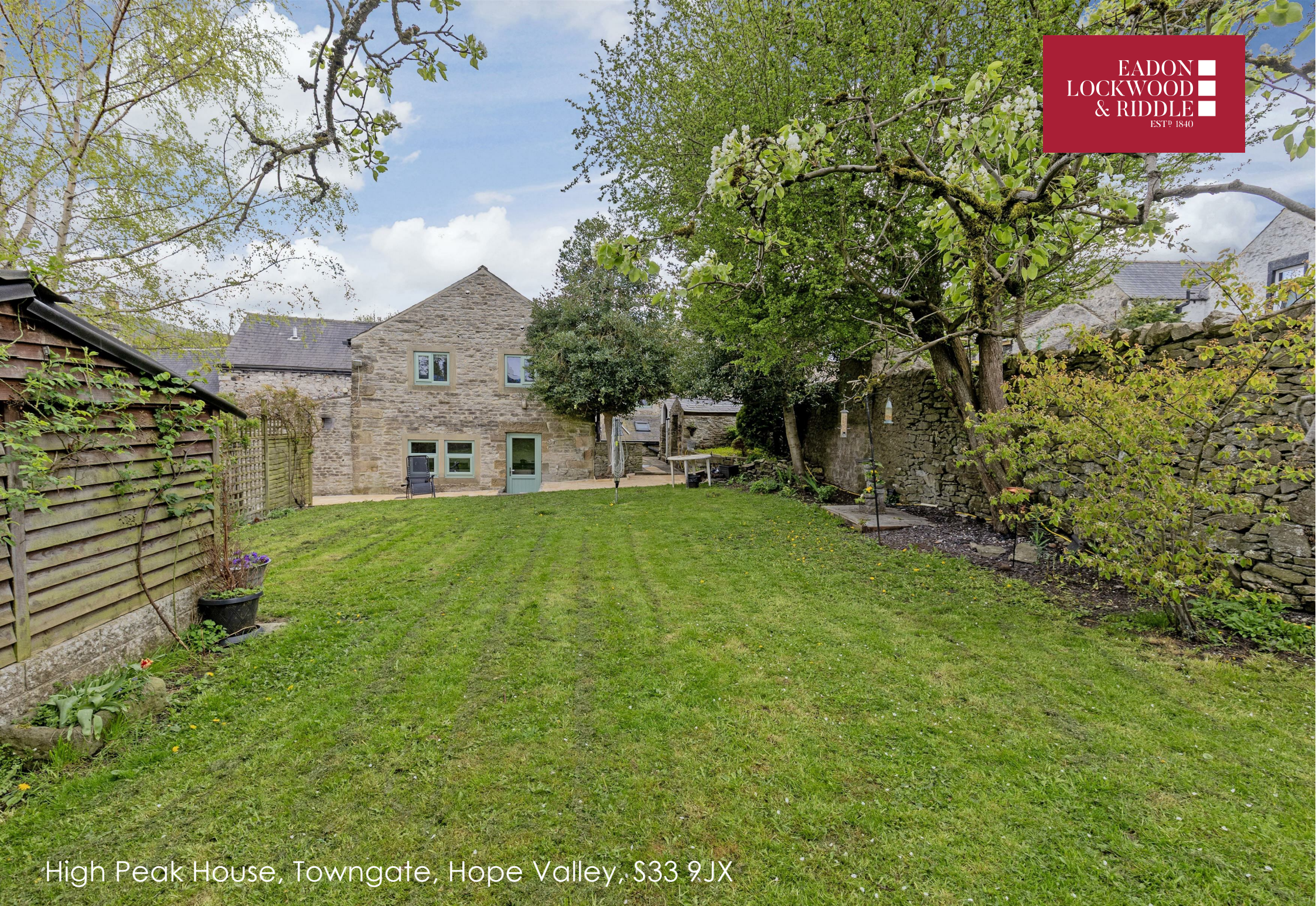
High Peak House, Towngate, Hope Valley, S33 9JX