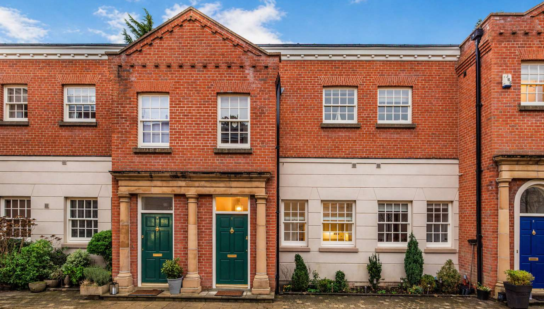
Tabley The Stables, Tabley House