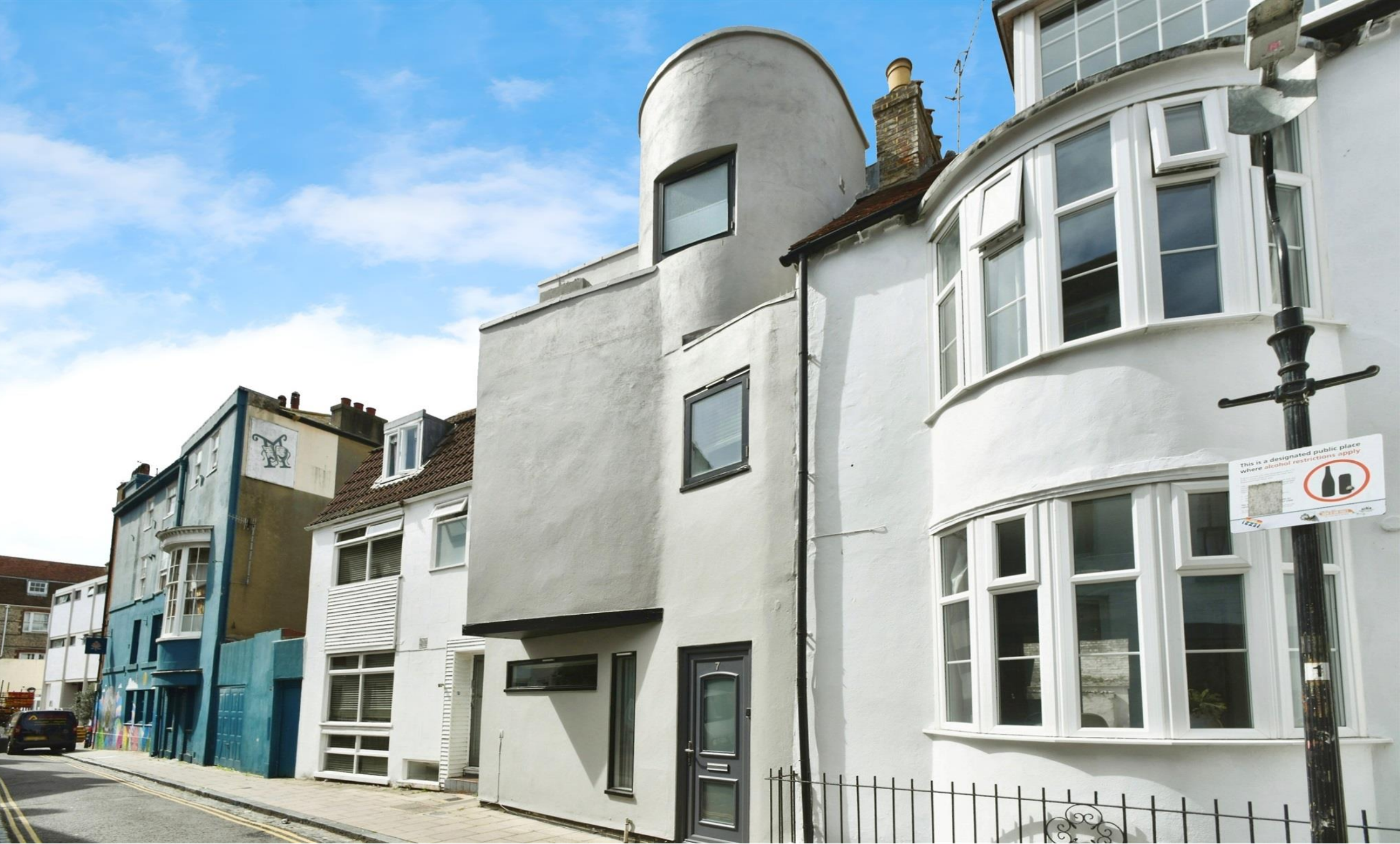
Princes Street, BRIGHTON BN2 1RD