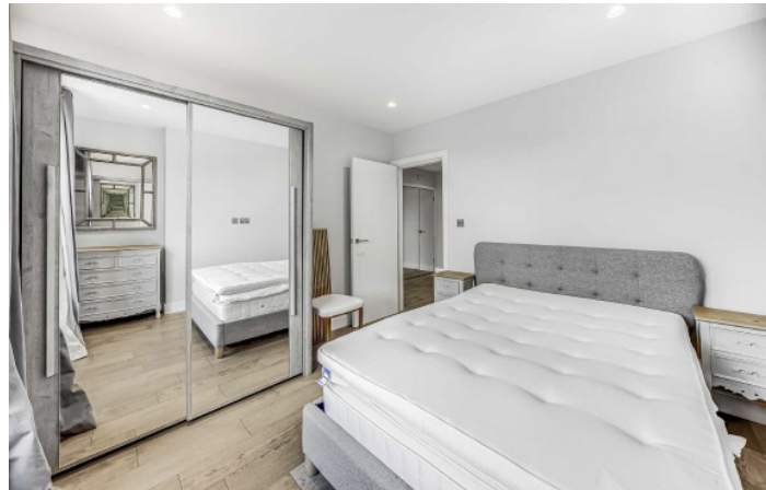
Moorhouse Road, W2