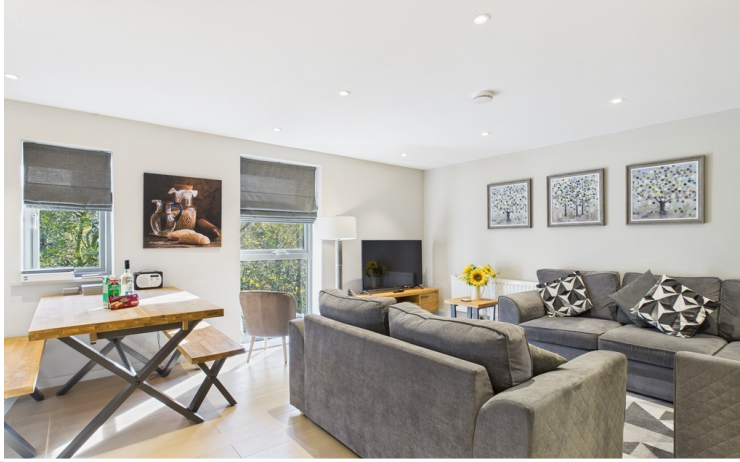
Open plan living / dining room