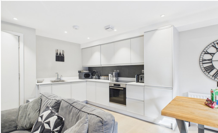
Open plan living / dining / kitchen area