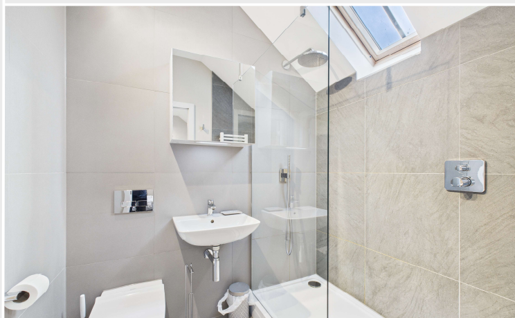
En-suite shower room