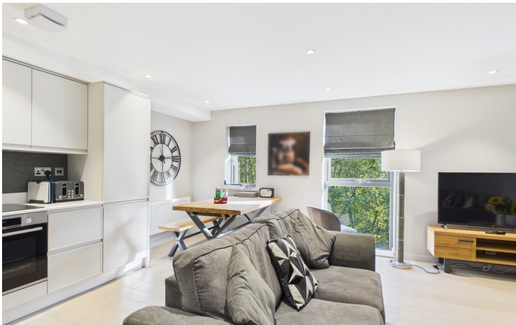
Open plan living / dining / kitchen area