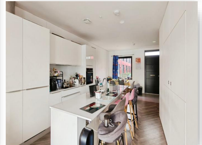
Redbridge Quay, Birkenhead, CH41 1DS