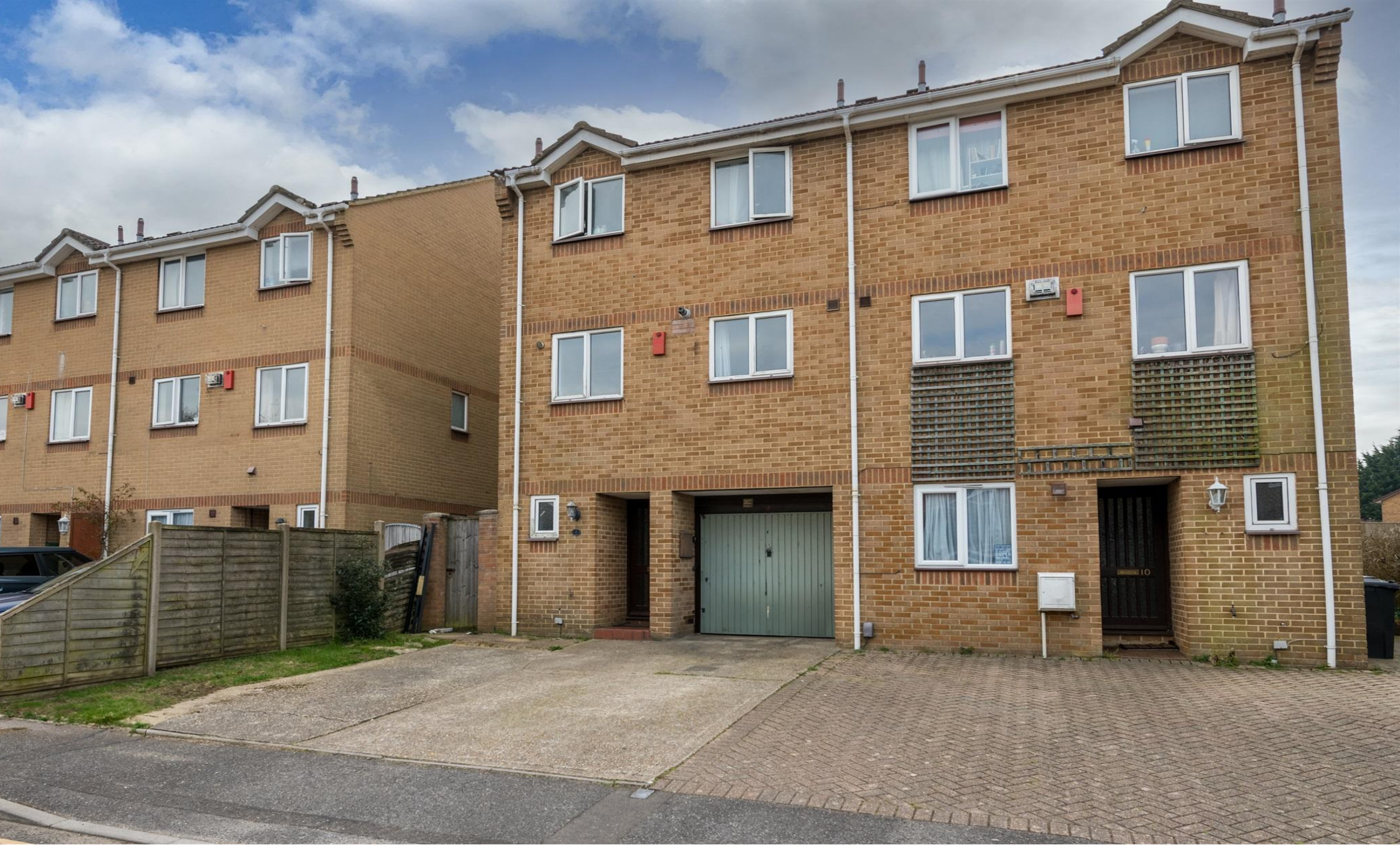
Mcwilliam Close, Poole BH12 5HP