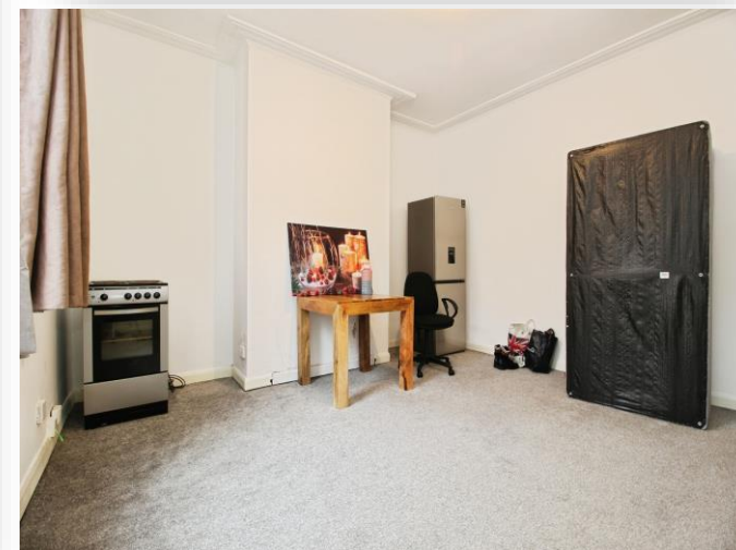
Recreation Terrace, Leeds LS11 0AW