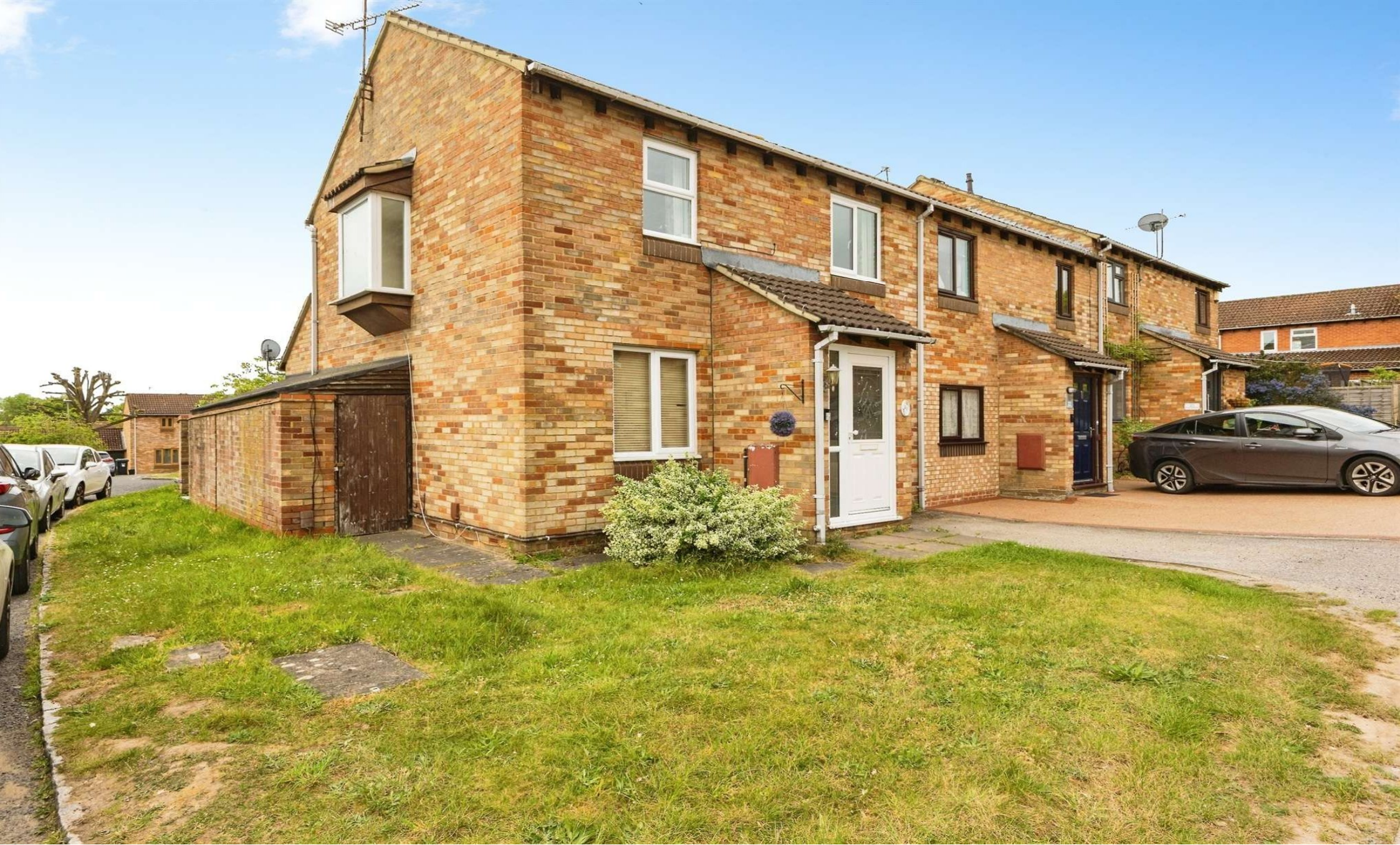
Ravenglass Close, Lower Earley Reading RG6 3BX