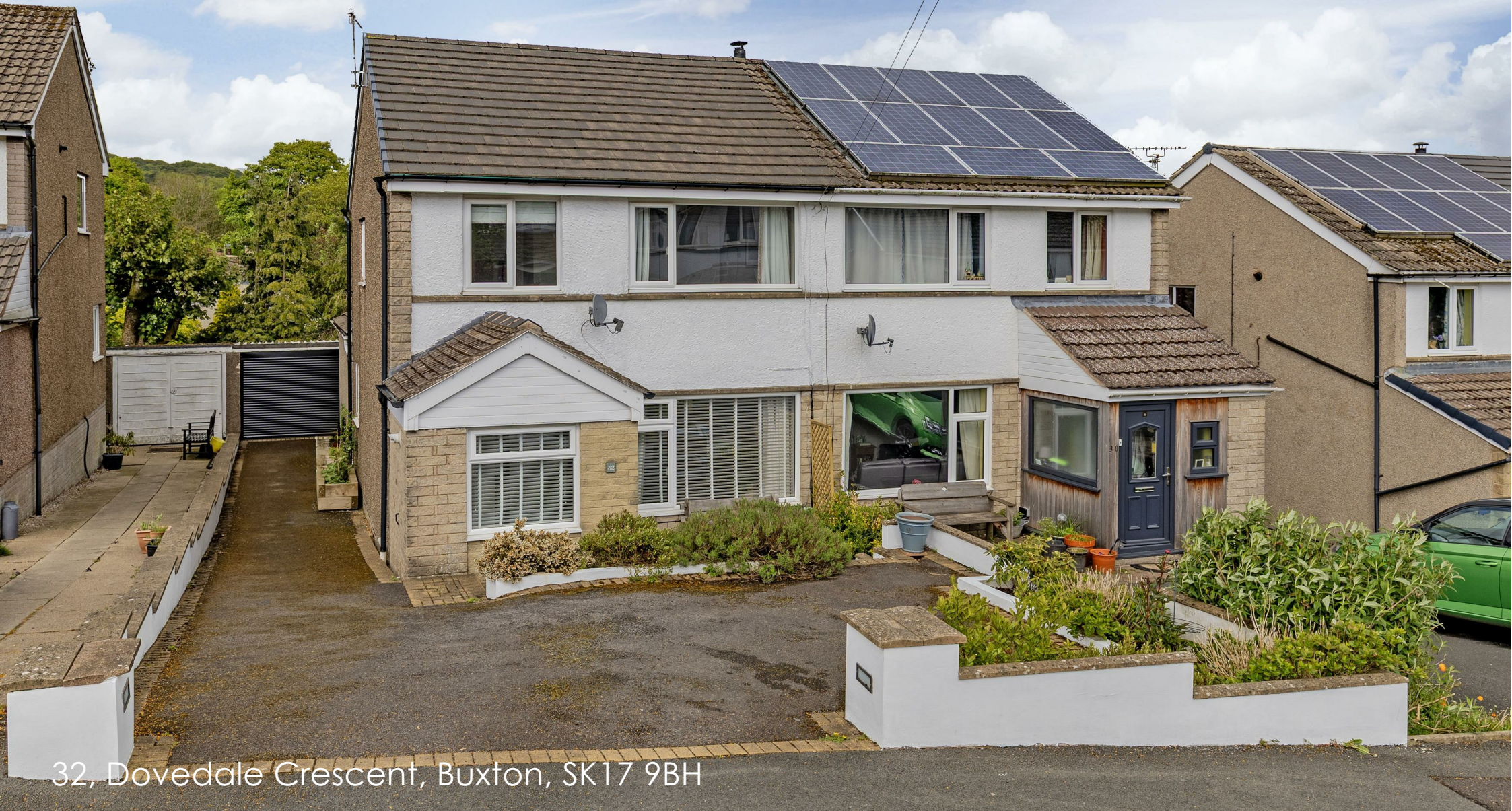
32, Dovedale Crescent, Buxton, SK17 9BH