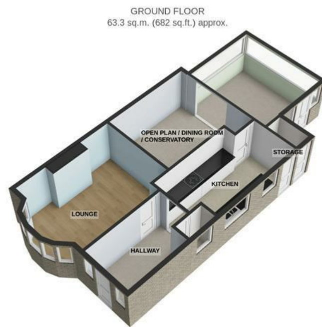
GROUND FLOOR 63.3 sq.m. (682 sq.ft.) approx.