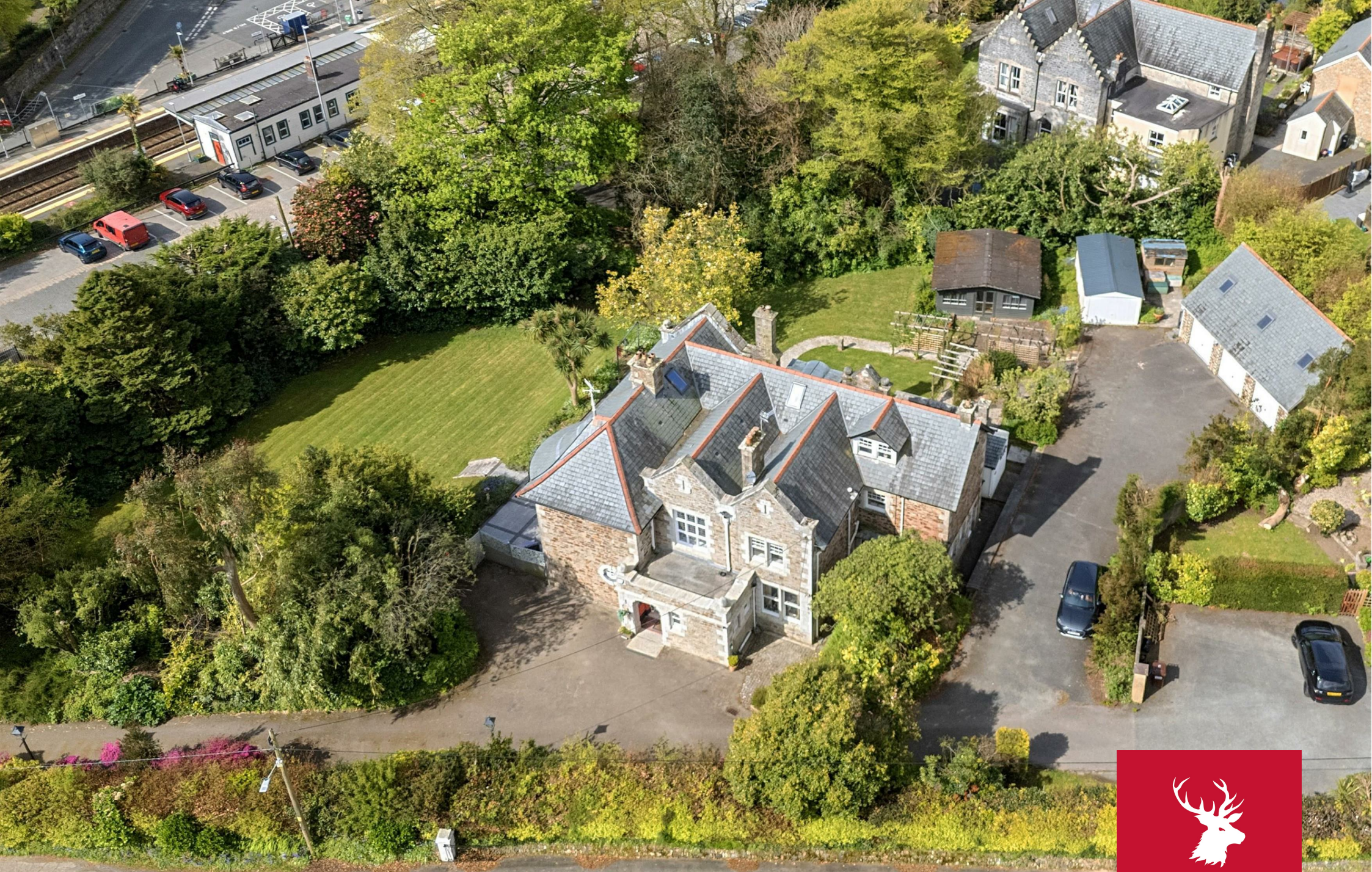
Polgray, 5, Palace Road