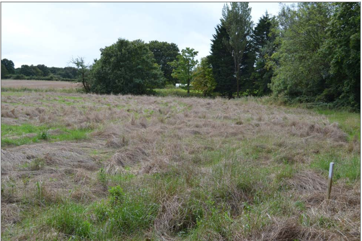
Building Plot adj, 11 Goose Green Avenue, Coppull, Chorley, PR7 4QD