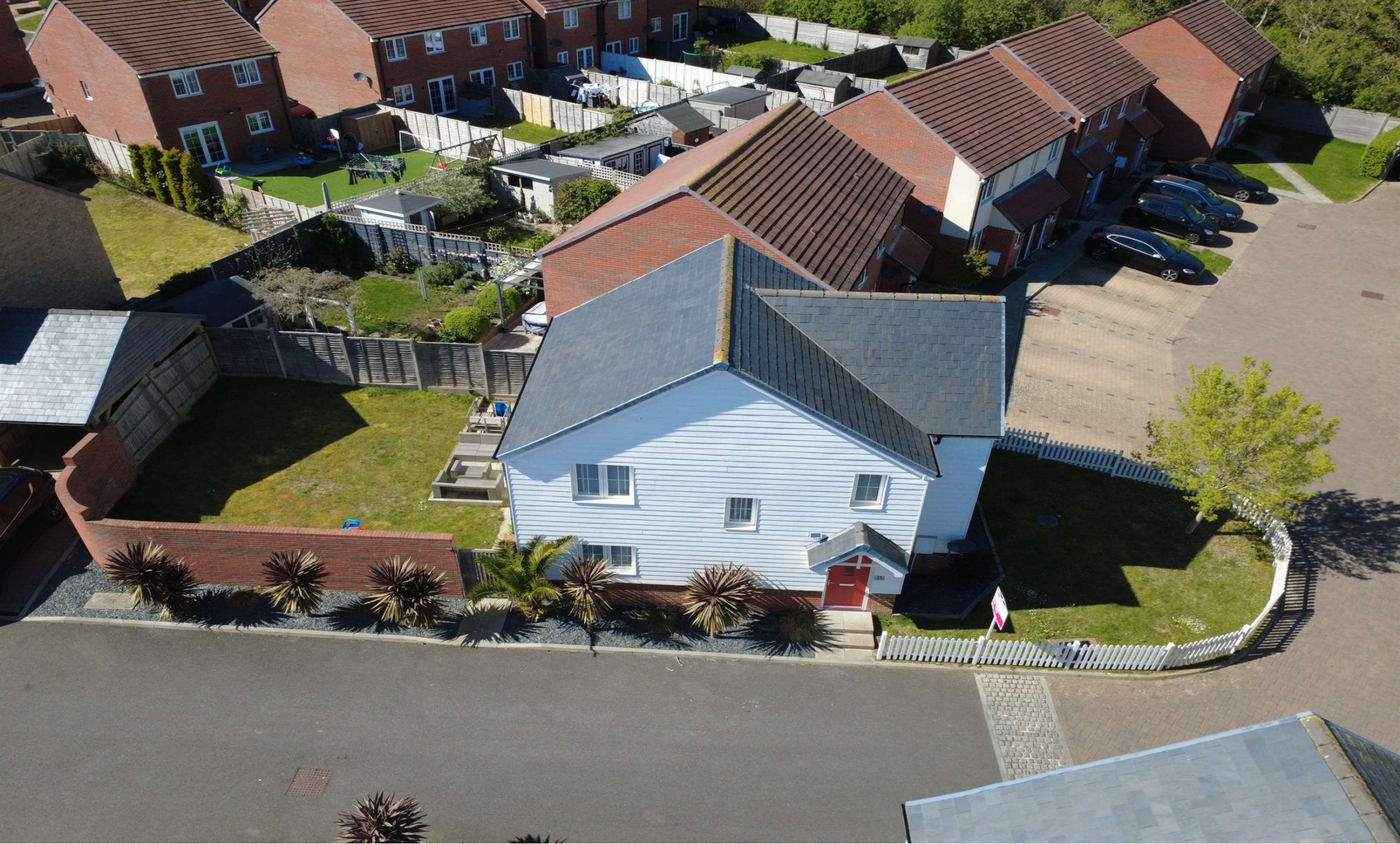
Primrose Field, Stone Cross Pevensey BN24 5GN