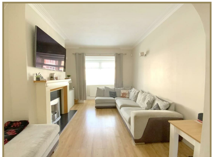
8 Florence Street, Grimsby, DN32 0JH £110,000