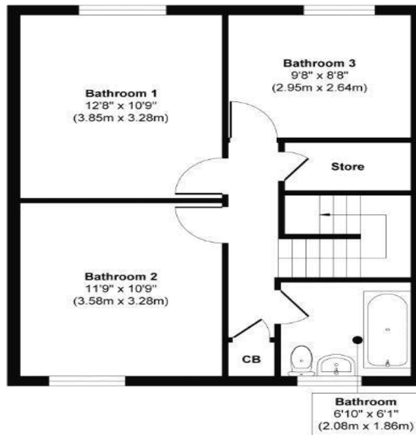
First Floor Approximate Floor Area 502 sq. ft (46.68 sq. m)

Approx. Gross Internal Floor Area 1074 sq. ft / 99.85 sq. m (Including Garage)