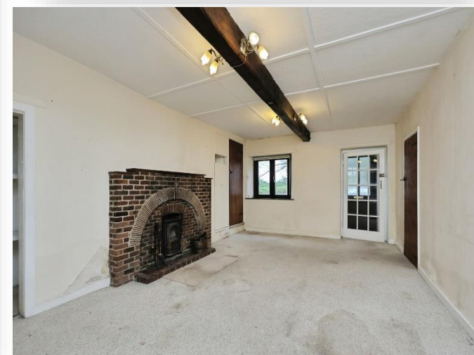
Footpath Cottage, Newton Road, Castle Acre, PE32 2AZ