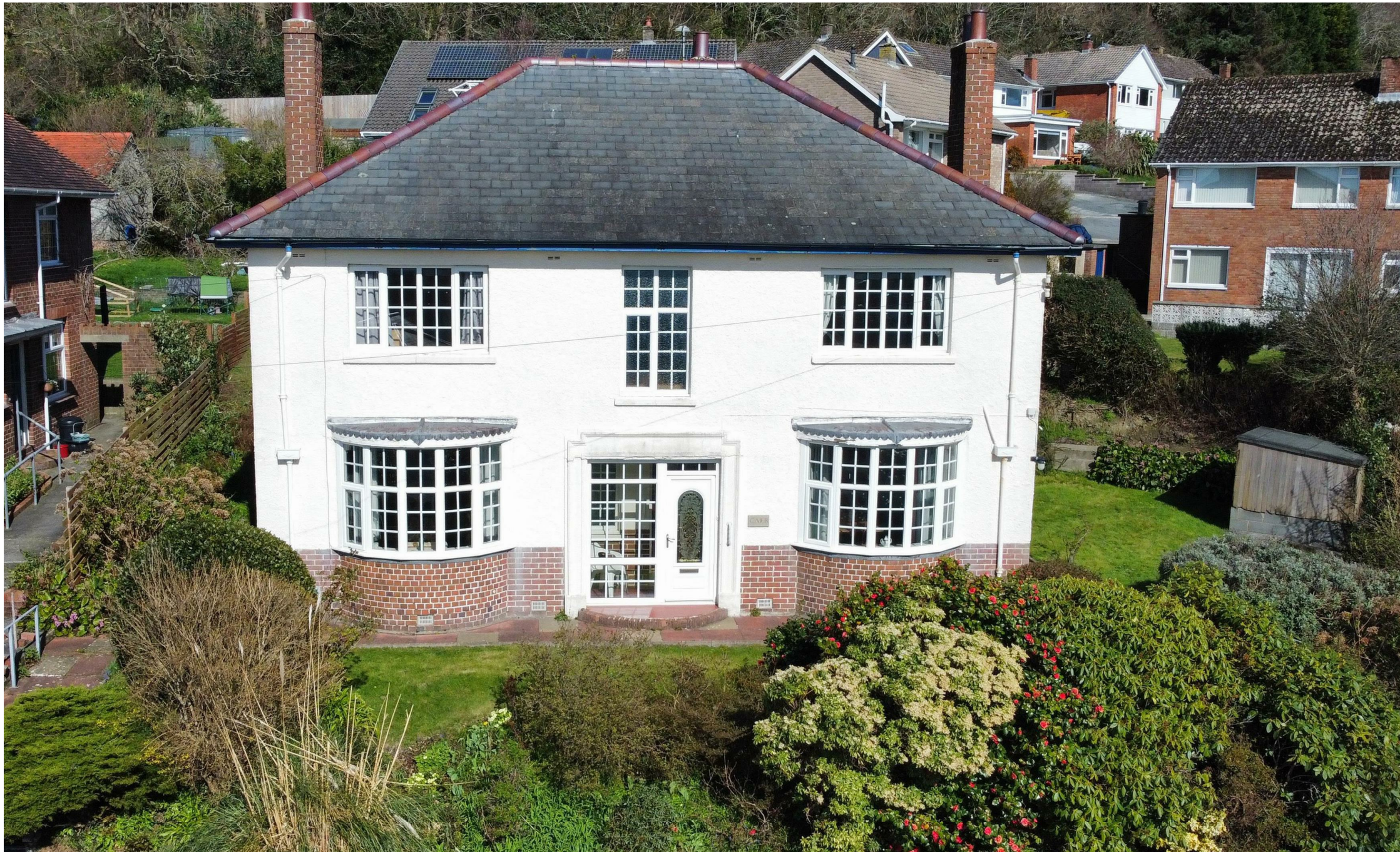
Caer Cae Melyn, Aberystwyth Ceredigion SY23 2HA Guide price £365,000