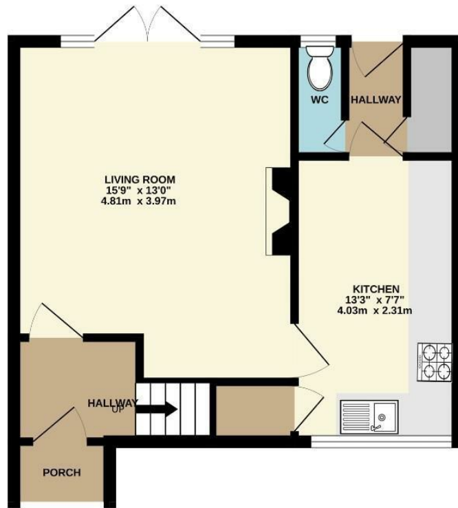
GROUND FLOOR 390 sq.ft. (36.3 sq.m.) approx.