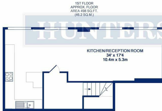
1ST FLOOR APPROX. FLOOR AREA 498 SQ.FT. (46.2 SQ.M.)