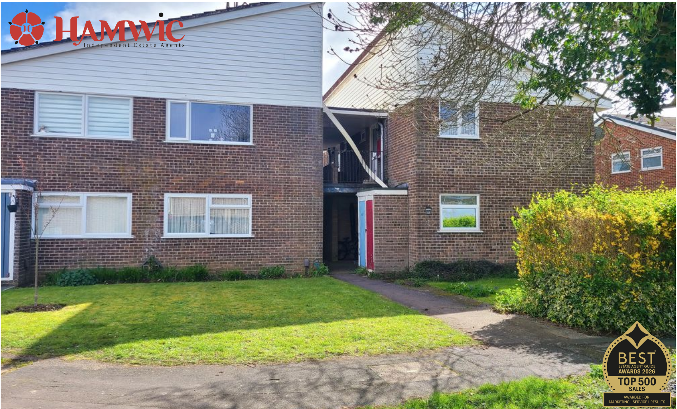
Treagore Road, Calmore, SO40 2UN Southampton