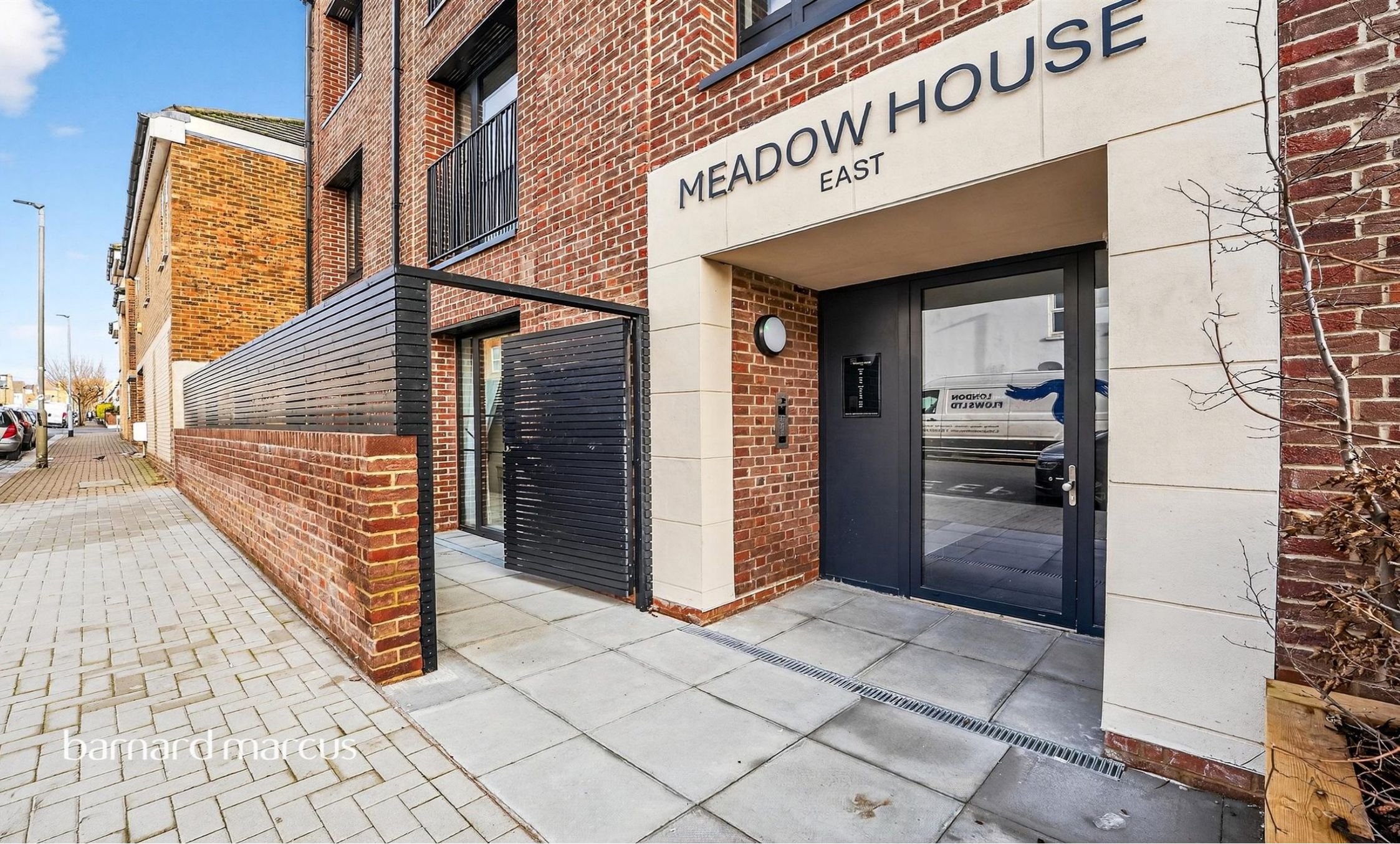
Meadow House Fallsbrook Road, London SW16 6DY