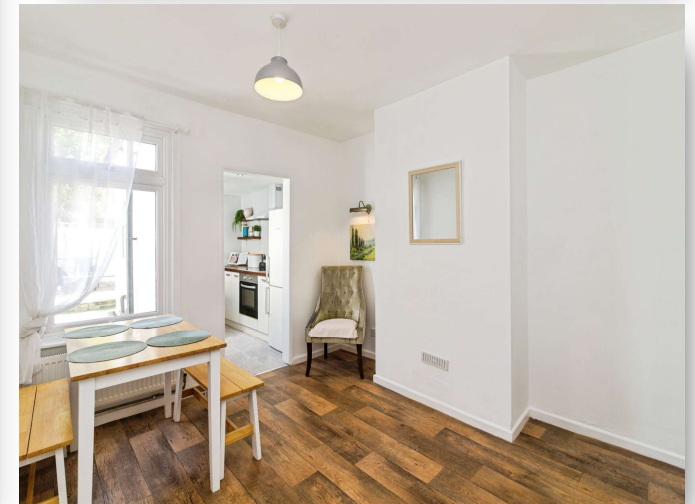
Alma Street, Lowestoft NR32 2EB