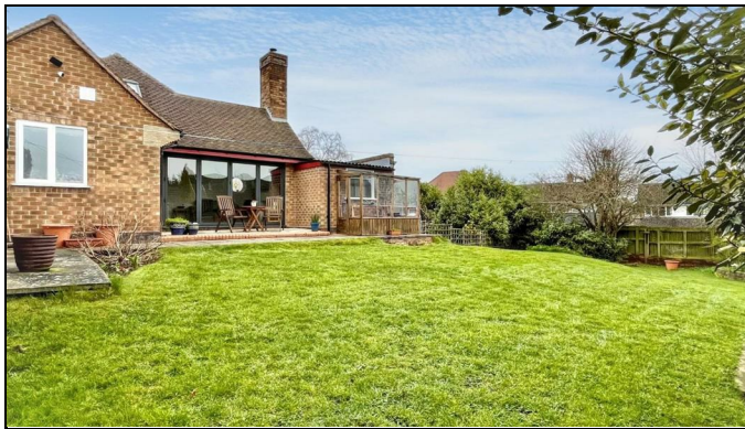
Holifast Road, Sutton Coldfield, B72 1AF