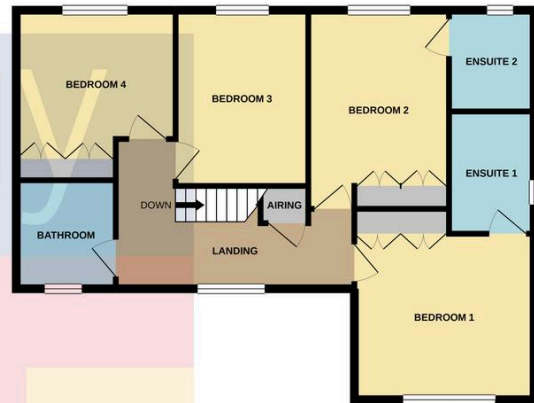
1ST FLOOR 749 sq.ft. (69.6 sq.m.) approx.