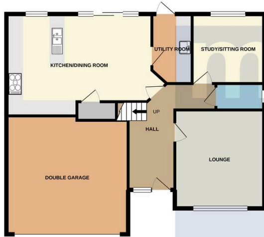
GROUND FLOOR 962 sq.ft. (89.4 sq.m.) approx.