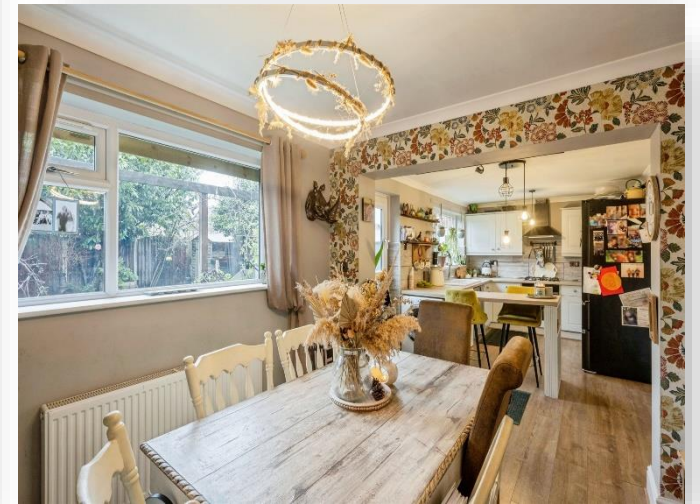
Riverside Gardens, Bolton-Upon-Dearne Rotherham S63 8NX