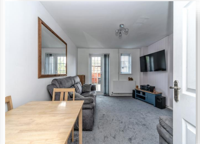
Marina Court, Bedford, MK42 9EE