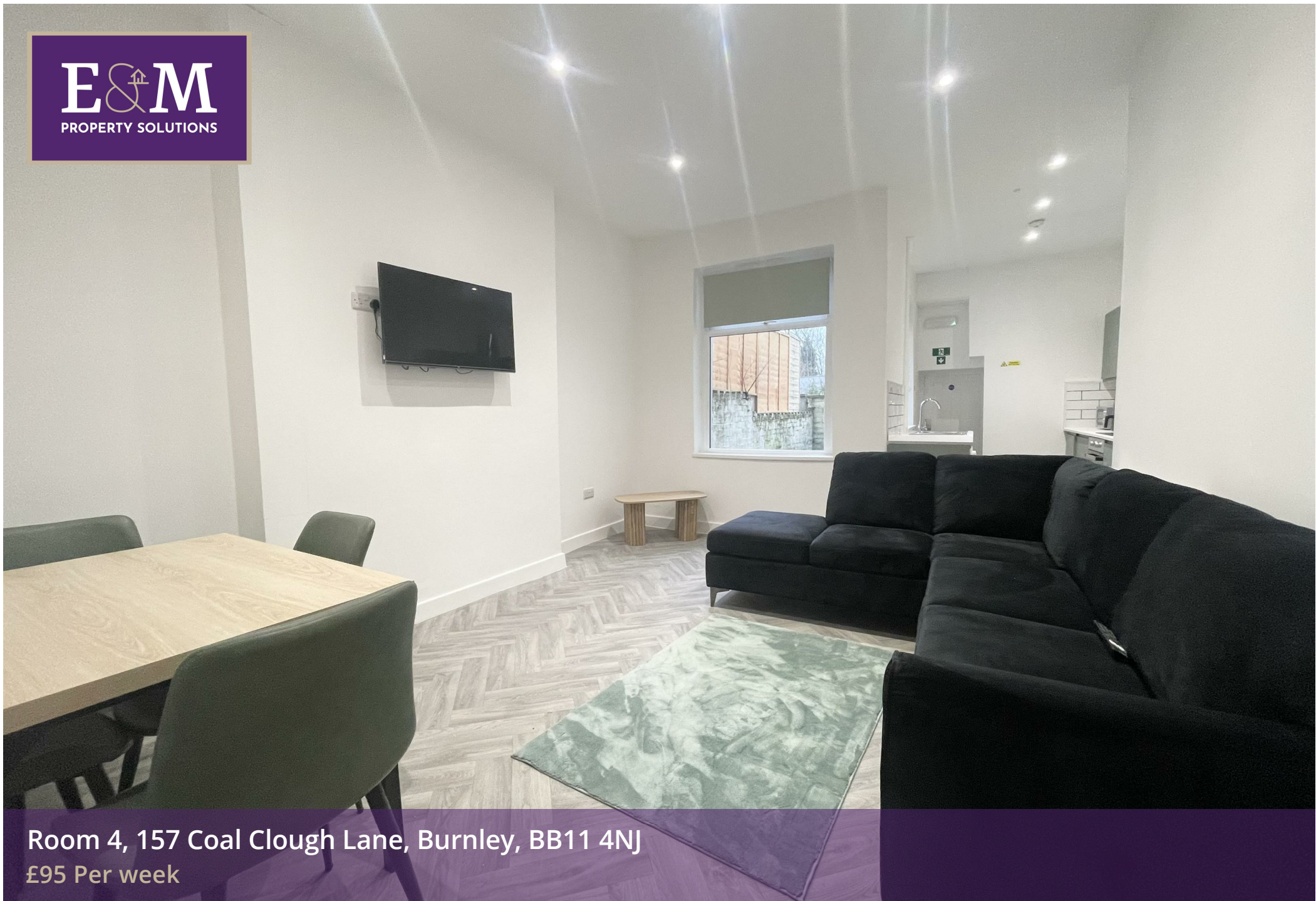
Room 4, 157 Coal Clough Lane, Burnley, BB11 4NJ £95 Per week