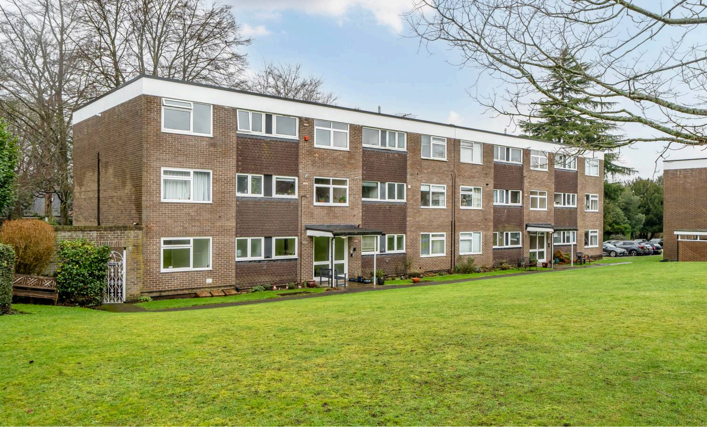
Briavels Court, Downs Hill Road, Epsom