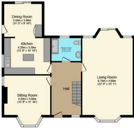
Ground Floor Floor area 96.2 sq.m. (1,035 sq.ft.)