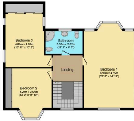
First Floor Floor area 93.0 sq.m. (1,002 sq.ft.)