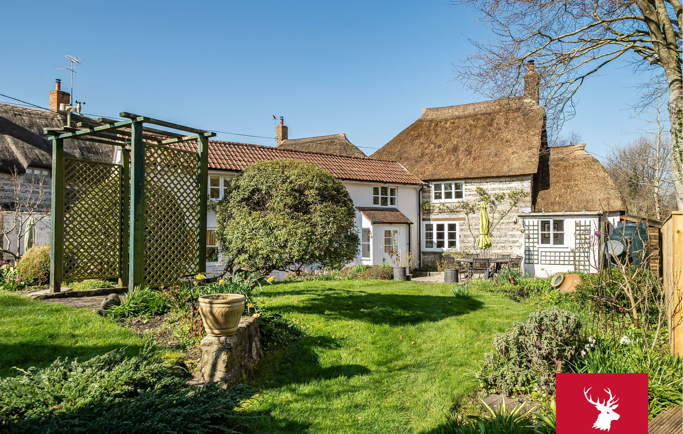
5 Southover Cottages, Southover