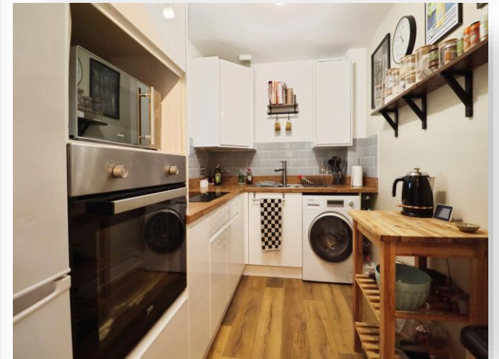
Grangemoor Court, Cardiff, CF11 0AH