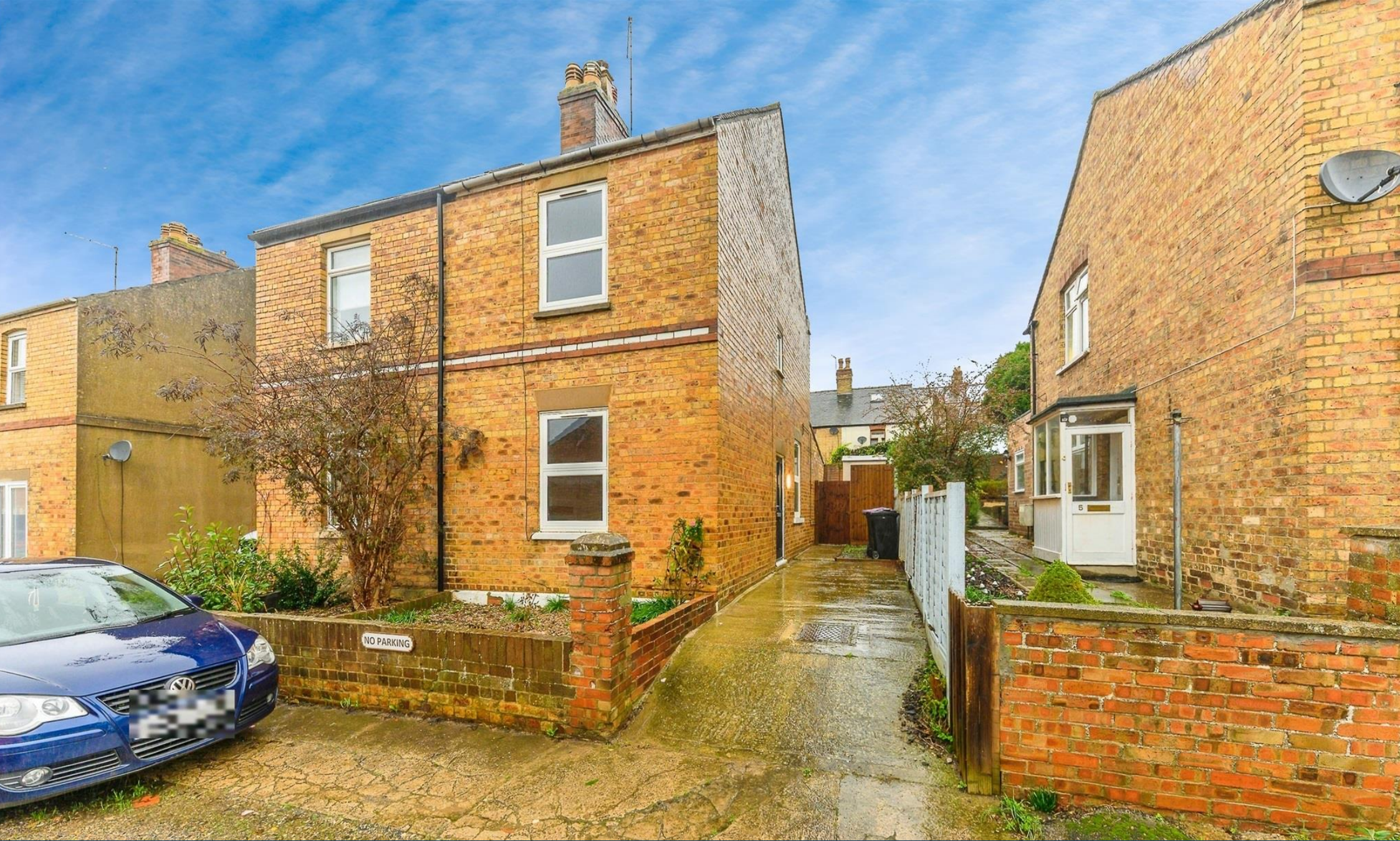
Coalville Cottages Stamford PE9 1ER