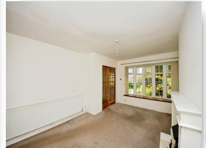
Langley Close, Wirral CH63 9YN