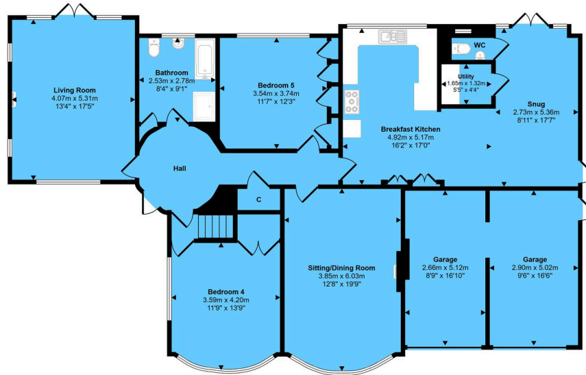
Ground Floor Approx 172 sq m / 1846 sq ft

Approx Gross Internal Area 253 sq m / 2723 sq ft