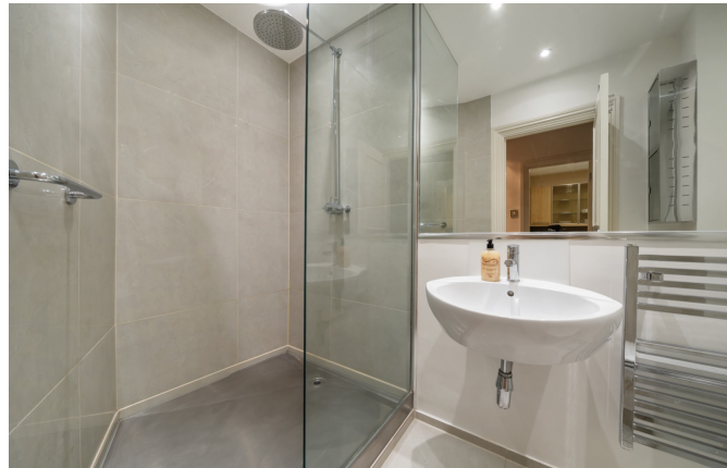
BASIL STREET SW3