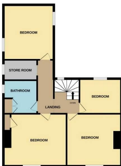
TOTAL FLOOR AREA: 1973 sq.ft. (183.3 sq.m.) approx.

Whilst every attempt has been made to ensure the accuracy of the floorplan contained here, measurements of doors, windows, rooms and any other items are approximate and no responsibility is taken for any error, omission or mis-statement. This plan is for illustrative purposes only and should be used as such by any prospective purchaser. The services, systems and appliances shown have not been tested and no guarantee as to their operability or efficiency can be given. Made with Metropix ©2024