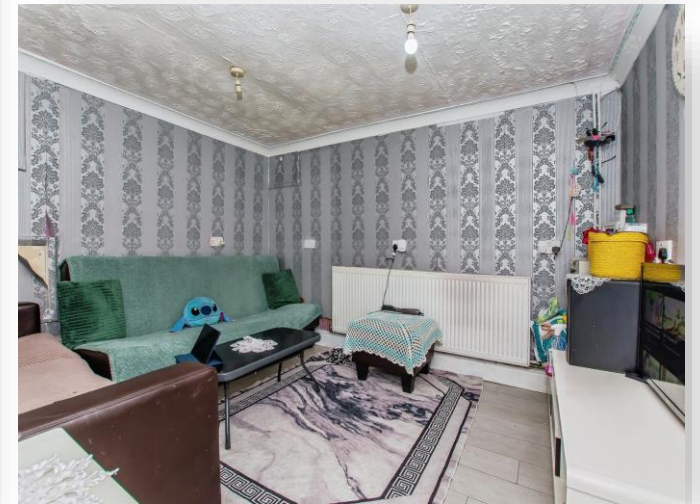
St. Peters Road, WISBECH, PE13 2NB