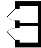
Out Building 6'6 (1.98) x 3'4 (1.02)