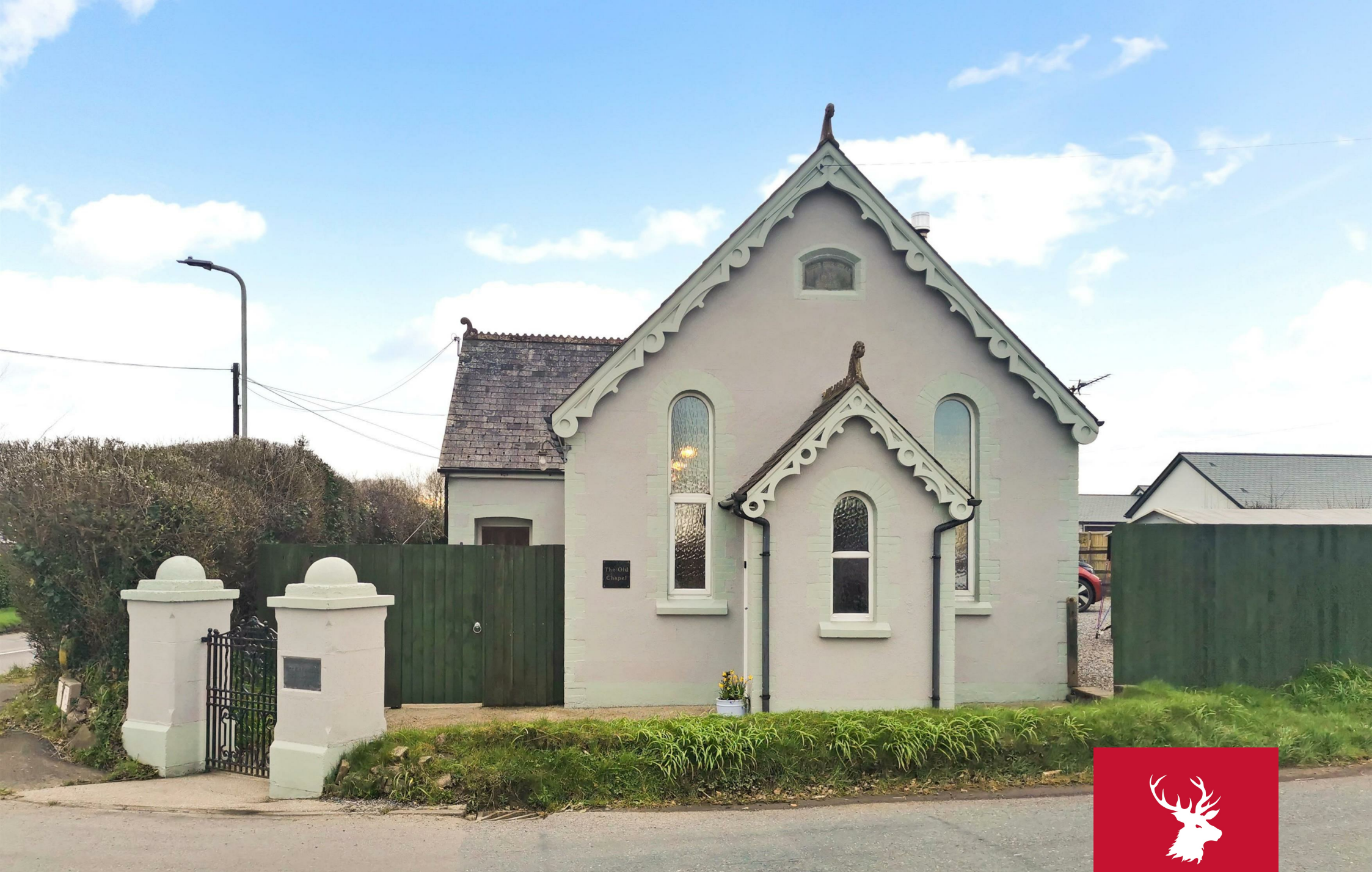
The Old Chapel