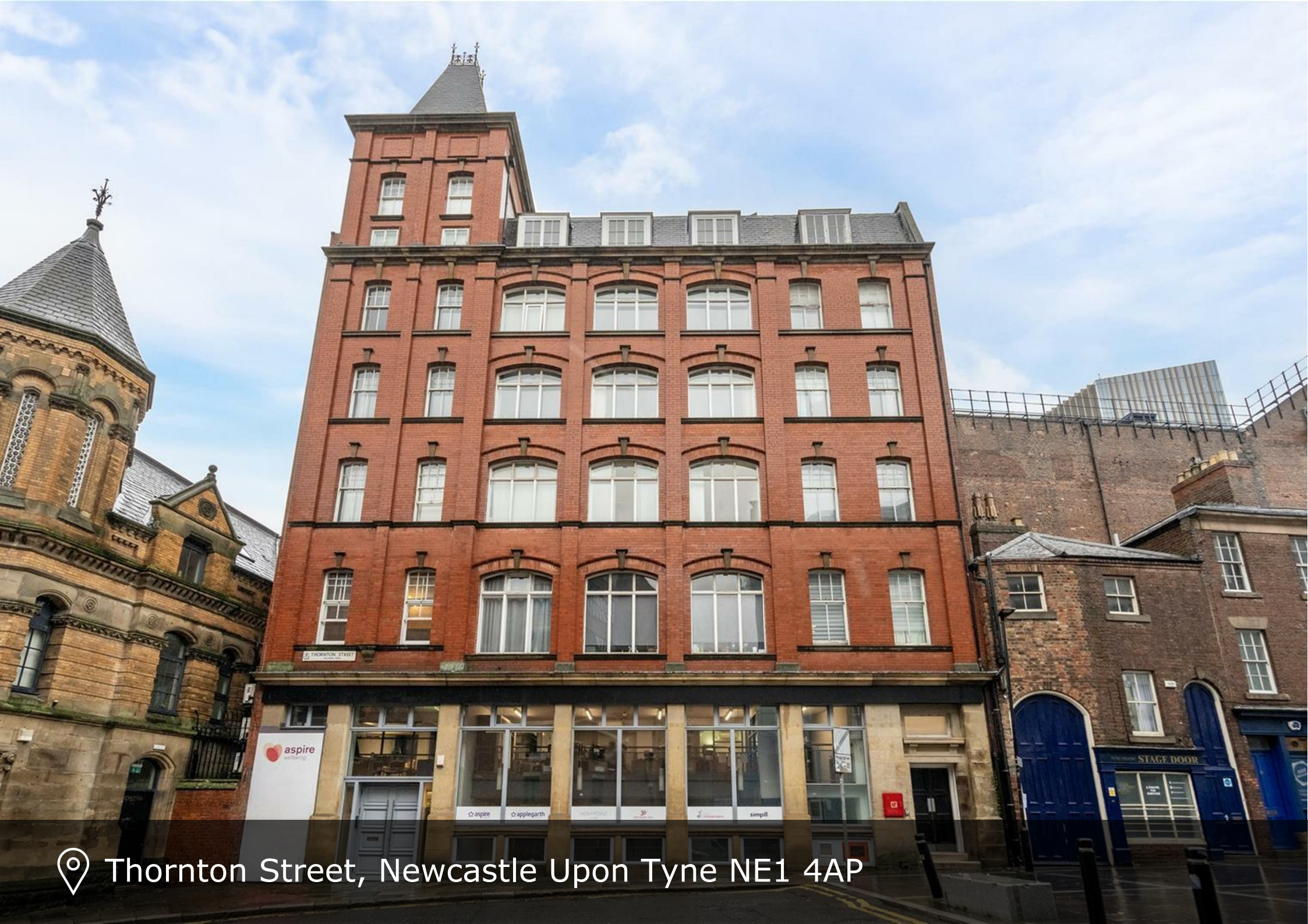
📍 Thornton Street, Newcastle Upon Tyne NE1 4AP