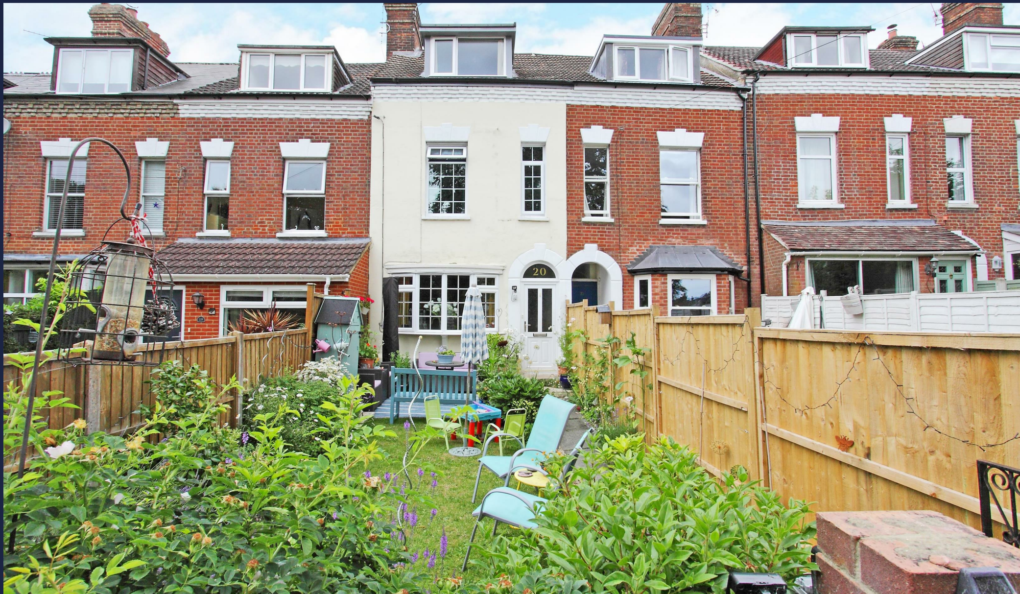
20, Wyndham Terrace, Salisbury