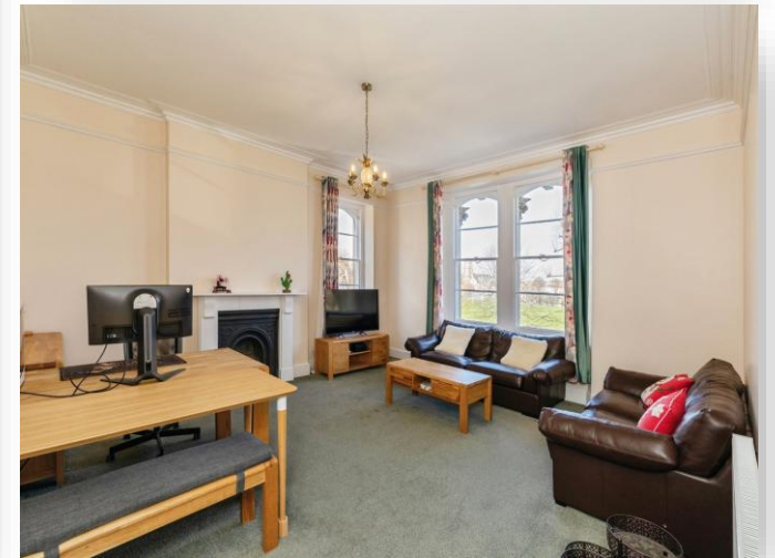
College Road, Clifton Bristol BS8 3HZ