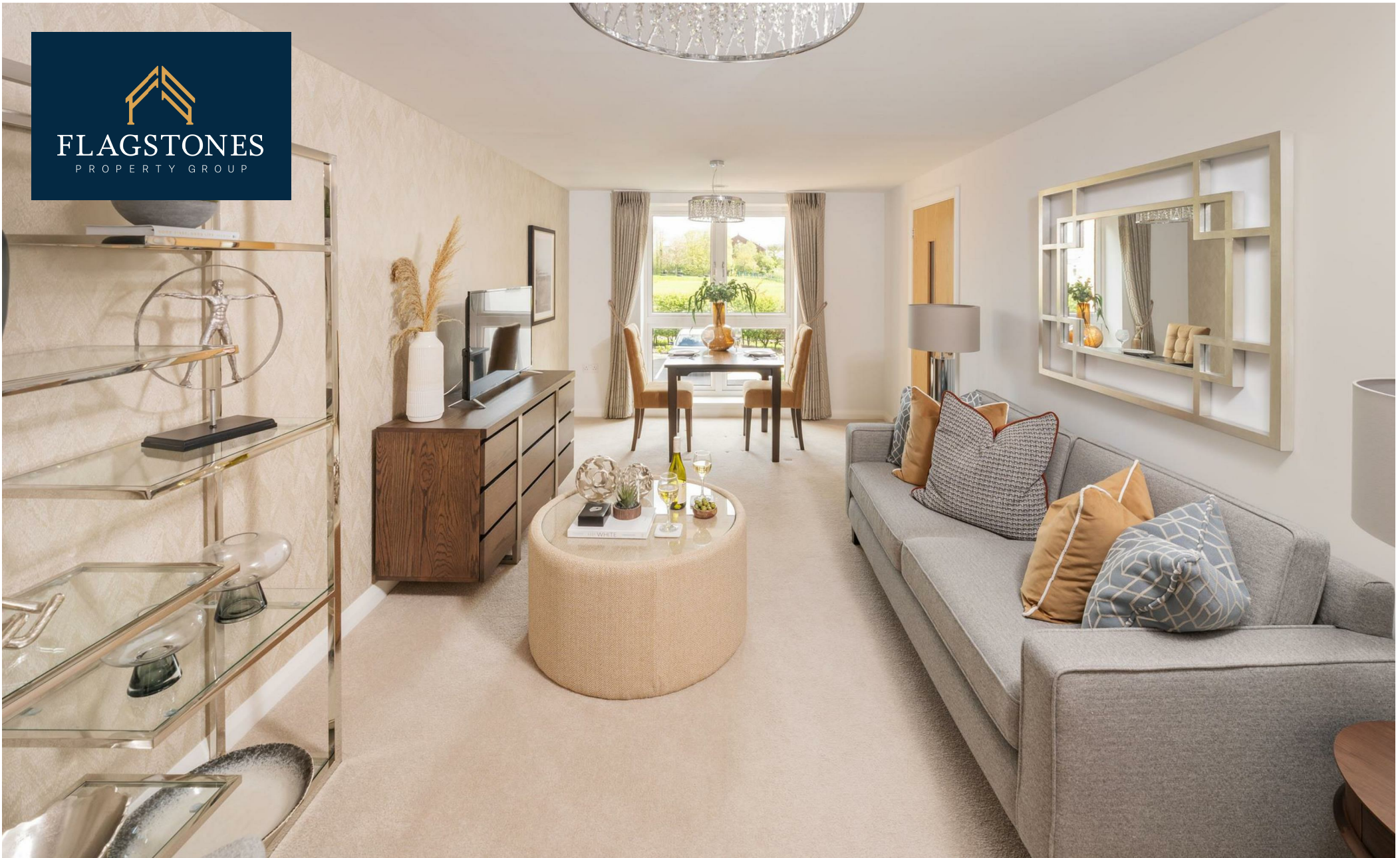
12 Stanley Place Stanley Gardens, Garstang, Preston, PR3 1XH £180,000