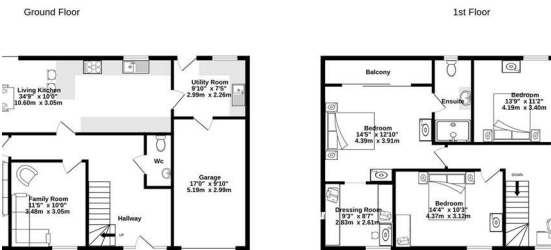
Measurements Taken From Developers Plans